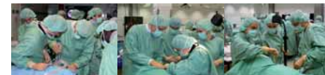
ORIGINAL COURSE PHOTOS